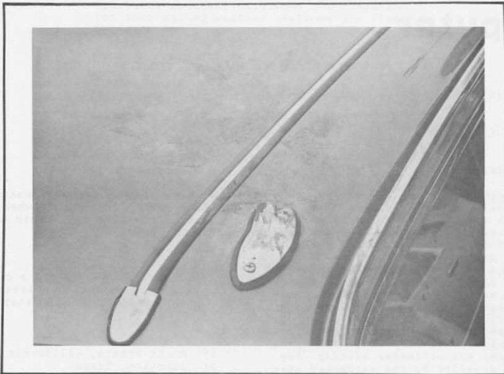
Figure 1. Picture of the top of the car, a late model Honda. Note the radio antenna mount damage and the speckled paint area.