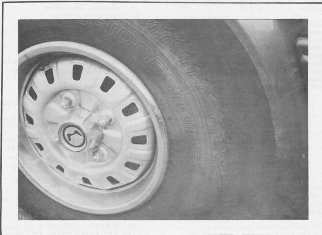
Figure 2. Left front tire. The whitened area is due to the lightning strike. Note burn mark on the rim.